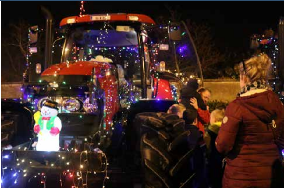
The Christmas Tractors of Carrick-on-Suir